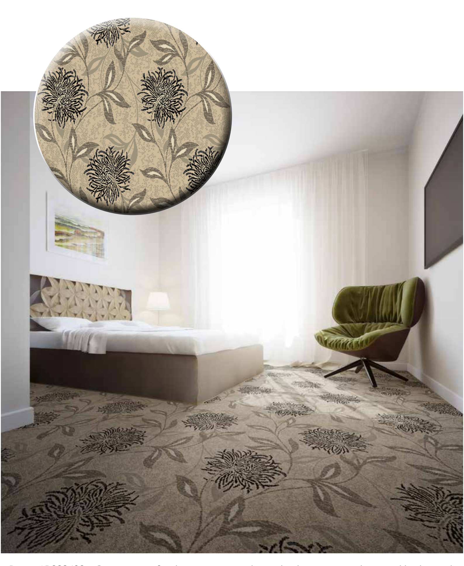
Design AD093400 – Contemporary floral pattern presented in stark colour contrast with textured background.