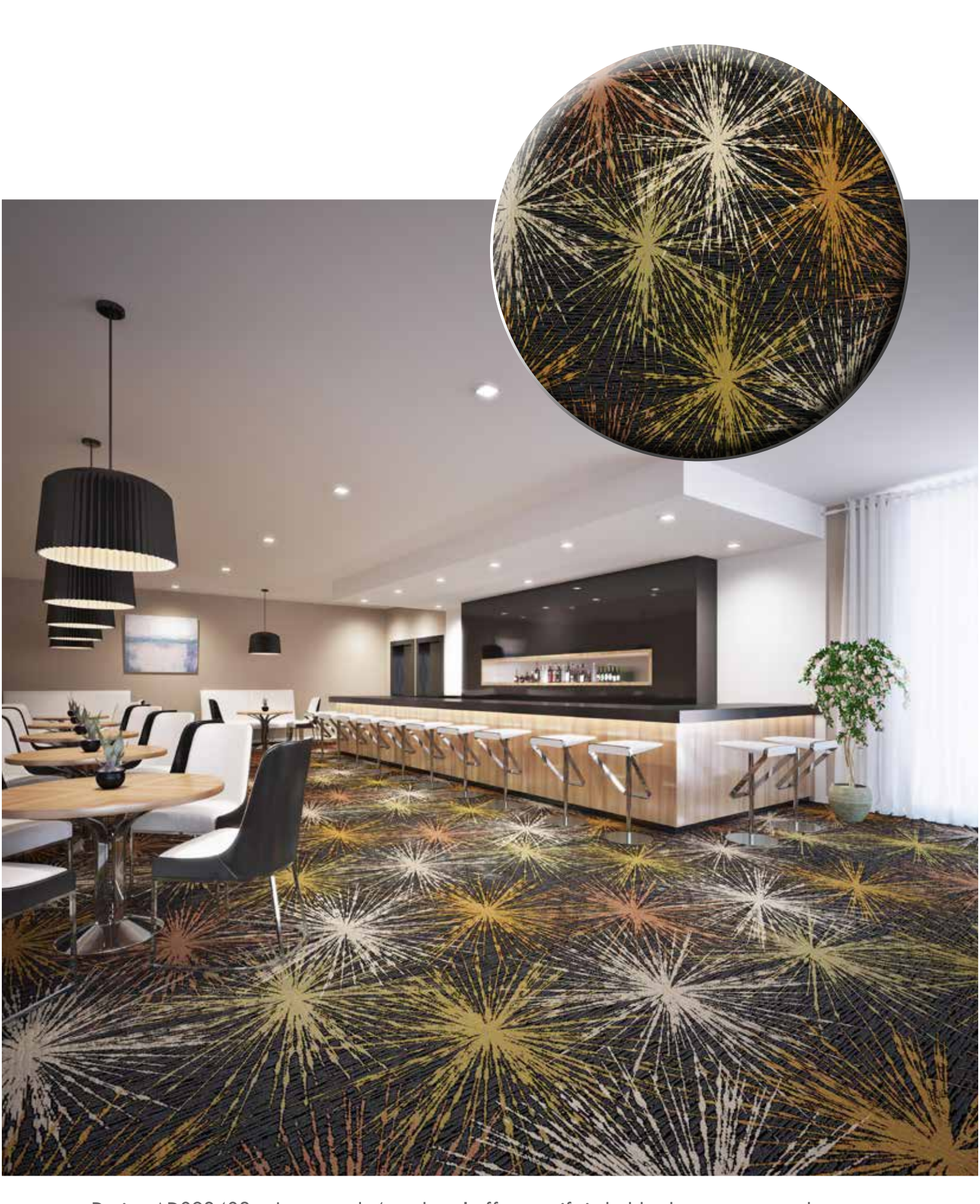
Design AD093403 - Large scale 'star-burst' effect motifs in bold colour contrast and textures.